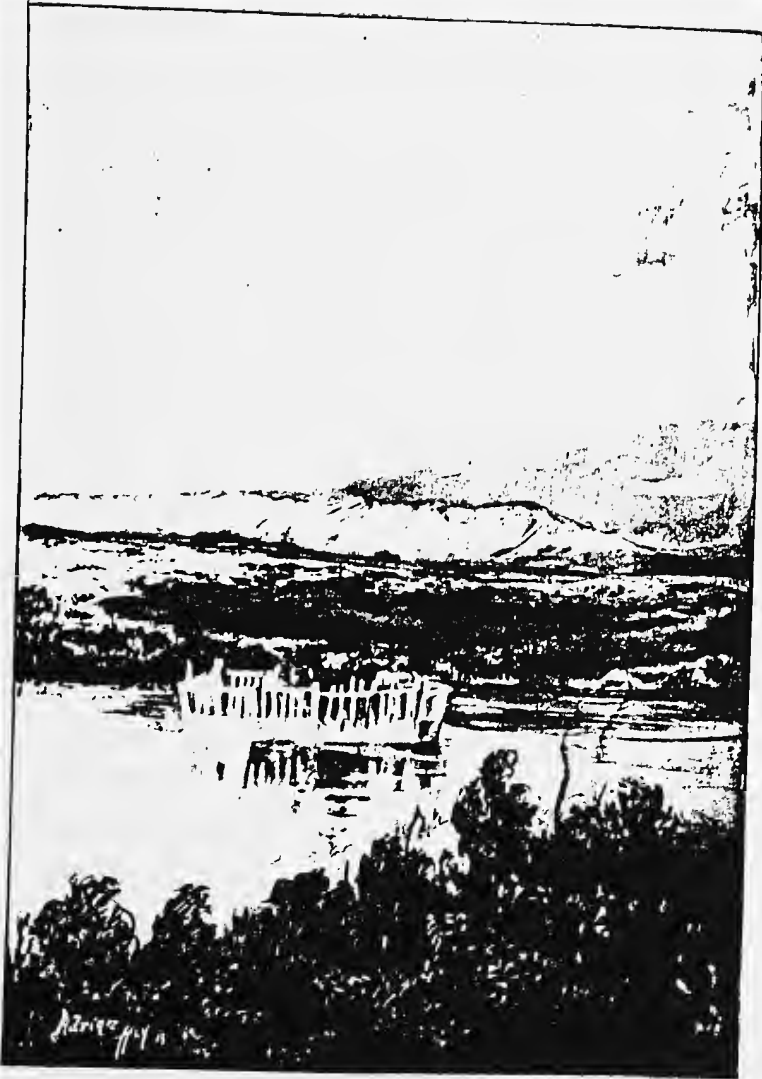
Beth'abara = Bethany beyond Jordan.—John i. 28.