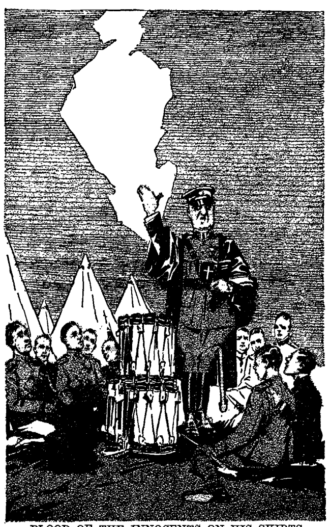
BLOOD OF THE INNOCENTS ON HIS SKIRTS (Jer. 2: 34) Pages 277, 278