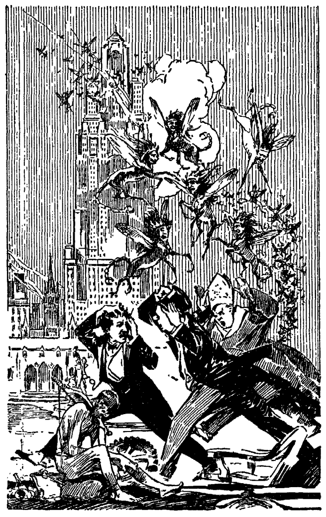
LOCUSTS DELIVERING THE TESTIMONY Pages 148, 149