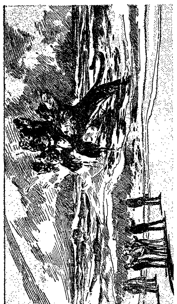
Page 262 "WILD BEAST OUT OF THE SEA"