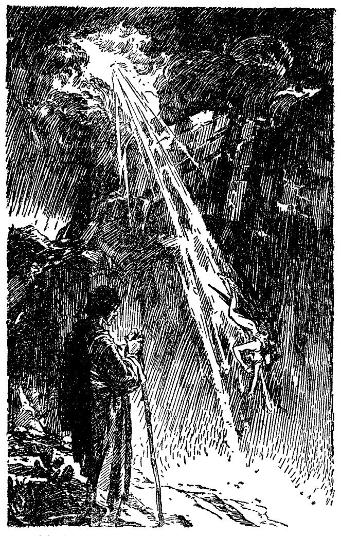
SATAN CAST OUT OF HEAVEN